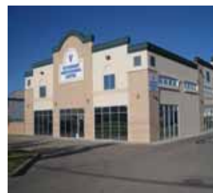
Company: Spectra Light Window Films Ltd. Product: Llumar R20 Solar Film Project: Poultry Vet Clinic Location: Airdrie, Alberta