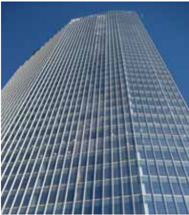
Company: Alberta Glass Project: Eighth Avenue Place Contractor: Ellis Don