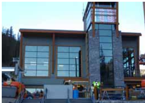
Company: DESA Glass Project: Sunshine Village Location: Sunshine, Alberta