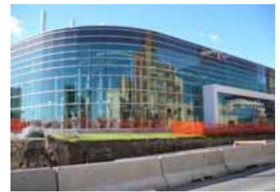
Company: Spectra Light Window Films Ltd. Product: Llumar Clear Security Film Project: Enmax Building