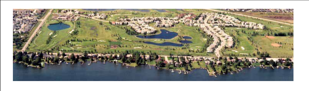
Annual Golf Tournament, 17 June 2011 Lakeside Greens, Chestermere, Ab

Come on out to our Annual Golf Tournament!