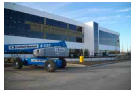
Company: DESA Glass Project: West Campus Location: Edmonton, Alberta