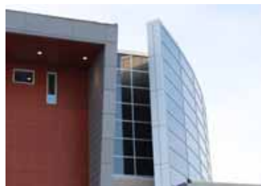
Company: Skyline Roofing Project: Glenmore Water Treatment Plant Product: Zinc, Prodema Panels Location: Calgary, Alberta General: PCL