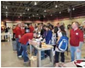
2010 CCA Career Fair Expo

This year the CCA Career Expo will be held at the BMO Centre on Stampede Park on April 14th 2011.