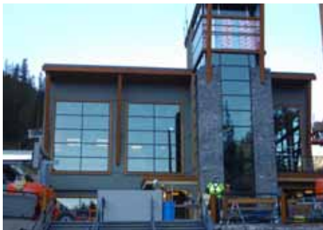
Company: DESA Glass Project: Sunshine Village Location: Sunshine, Alberta