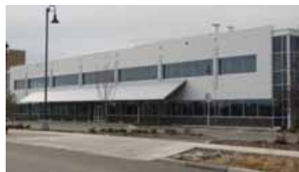
Company: Attivo Glass Project: Cochrane Community Health Centre Aluminum: Kawneer 1602 Series Glass: Visteon Versalux Blue/Sungate 500