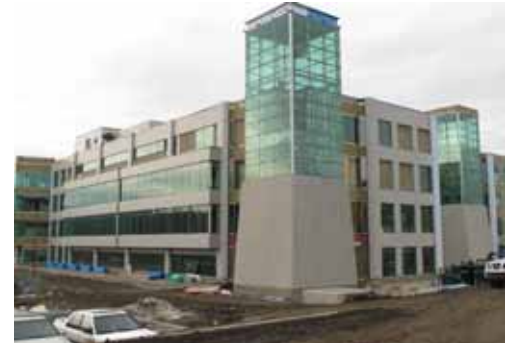
Company: Attivo Glass Project: Cambrian Executive Place Aluminum: Kawneer 1600 Series 1 Glass: Atlantica/SB60 (#3)/SB60 (#5)