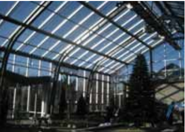
Company: Alberta Glass Project: The Zoo Conservatory Contractor: Ledcor Location: Calgary, Alberta