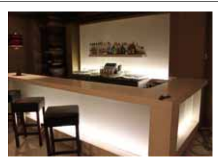
Company: Glass Guild Project: Sociale Bar & Grille Location: Calgary, Alberta