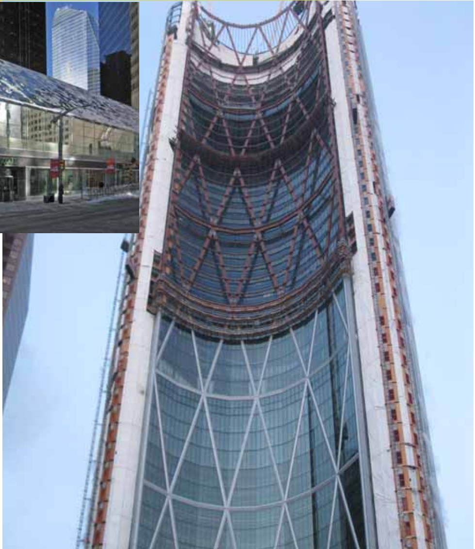
Upper Left Corner:

Company: Ferguson Glass (Western) Ltd. Project: Devonian Gardens Glass Replacement Location: Downtown Calgary, Alberta