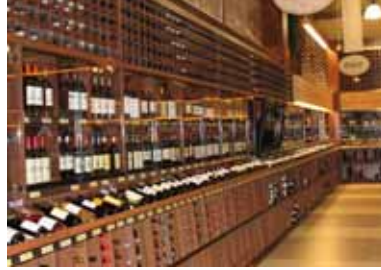
Company: Glass Guild Project: Calgary Co-op Liquor Store Oakridge Location: Calgary, Alberta