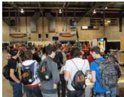
2010 CCA Career Fair Expo

The interest generated in our industry at this event is amazing and is only equaled by the support from our member