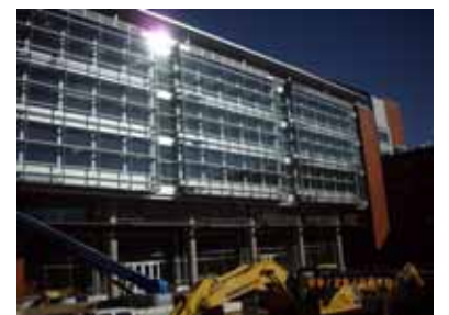
Company: Alberta Glass Project: CCIS, U of A, Contractor: PCL Location: Edmonton, Alberta