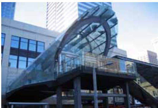
Company: Ferguson Glass (Western) Ltd. Project: 7th Avenue LRT Block G + 15 Location: Downtown Calgary, Alberta